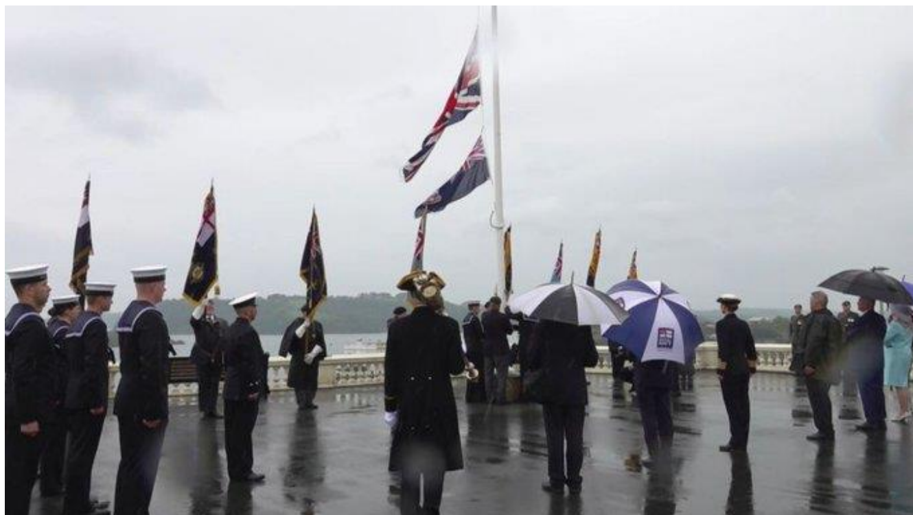
Falklands Flag Unveiling at Plymouth Hoe, 21st June 2021

The SAMA (82) Annual General Meeting and 40th Anniversary Memorial Service and reunion weekend will take place between Friday 1st—Monday 4th April 2022. Please find attached the booking forms.