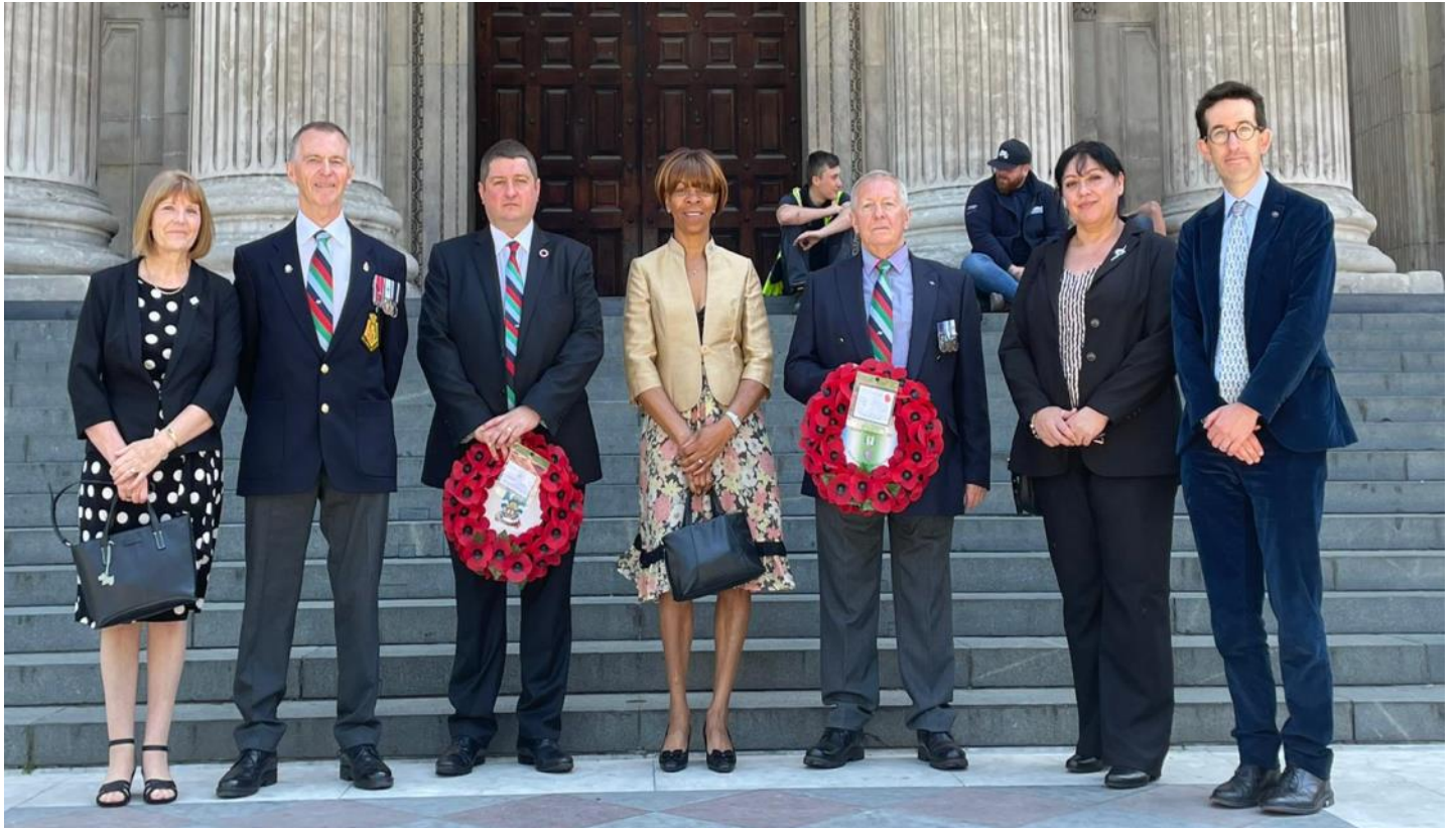
On the 14th June 2021, a Liberation Day Service was held at St Paul's Cathedral.